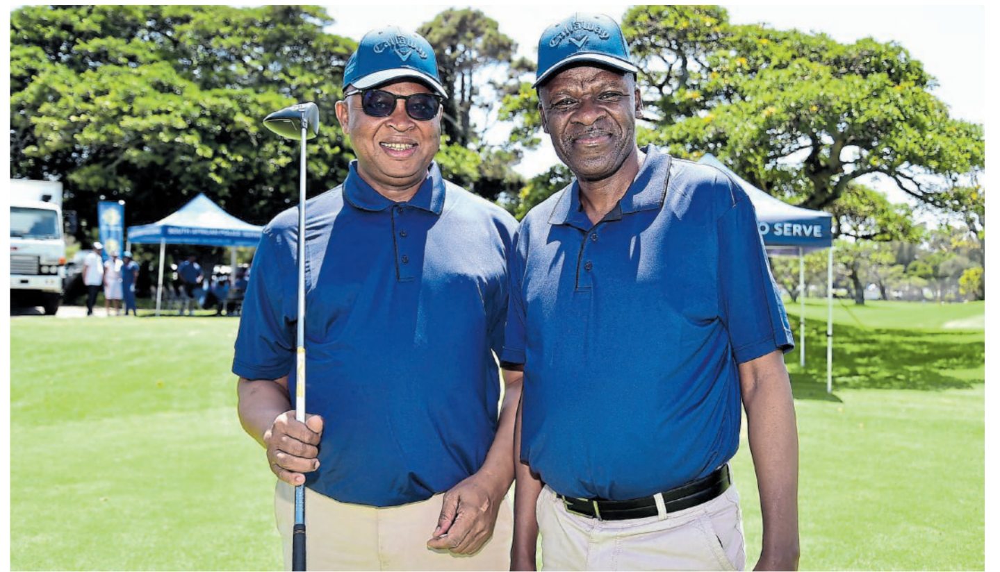
FULLY ARMED: Teeing off at the PE Golf Club yesterday are deputy police minister Cassel Mathale, left, and national police commissioner Gen Khehla Sitole, who are in the Bay for National Police Day

Yesterday, delegates were busy formulating a list of resolutions in this regard to be sent to various authorities to feed into policy.